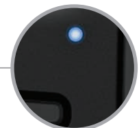
LED Status Indicator