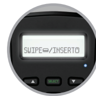
Backlit Dot-Matrix LCD