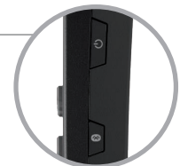
Power On/Off Button & Pairing Button