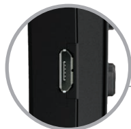
Micro USB Port