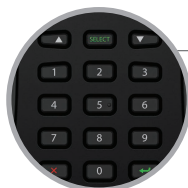
Secured PIN Pad